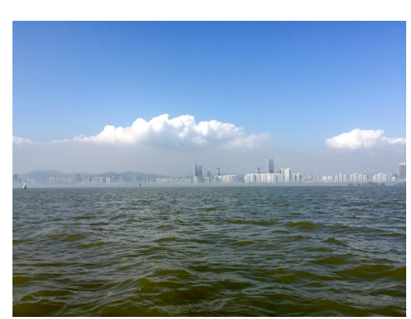
Image 1. Anthropogenic pollutant can be observed in the atmosphere of many Chinese coastal cities, in this study researchers investigated the potential impact of this pollution on the water quality.